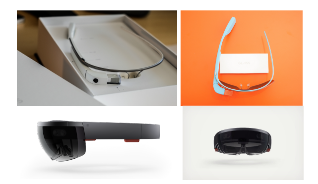
Figure 1. Top: Google Glass viewed in a box [54] and from above [41]. Bottom: Microsoft HoloLens viewed from the side and from the front [56]. Images CC-BY 2.0